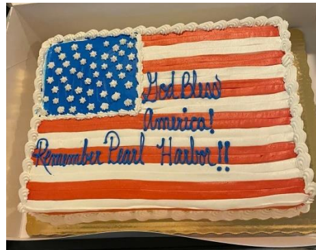
CAKE MADE FOR AMERICAN LEGION POST 90