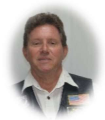
Wreaths across America Day