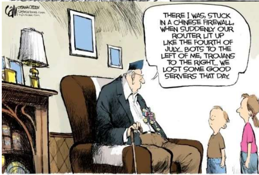
FUTURE WAR STORIES